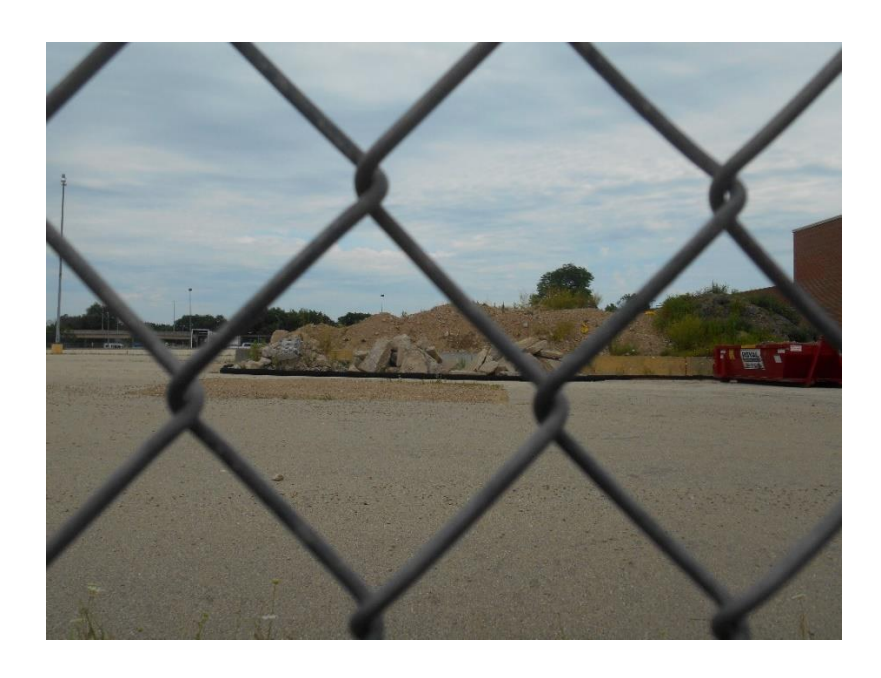
Photo below taken on July 14, 2020 by community member, showing pile of soils and broken concrete and cuts out of pavement:

Further, relatedly, Metro's statement that "the existing storm water system is adequate and will not require modifications" is incorrect. On June 18, 2020, City of Madison hydrogeologist Brynn Bemis stated in an email to us that "stormwater system on the site "is being actively redesigned right now." Community members have observed that the current owners of the site have been removing pavement at the site in areas where storm and/or sanitary lines are likely to be, presumably related to this work.