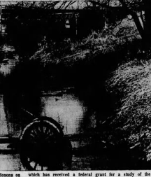
Starbuck Creek, which flows into Lake Monona in the Rock Drainage Basin, shows signs of being unbalanced.